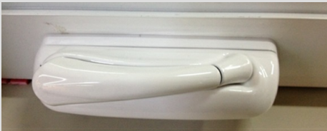
Contemporary Stainless Steel Operator with Nesting Handle

This industry-leading casement already offers design pressures up to +110/-194.3 PSF, matching sightlines to project out windows, double weather stripping and extruded snap on square glazing beads. The addition of a new stainless steel operator now completes the package. The operator, just like the one on the Estate 238 Casement Window , is a significant upgrade and offers product continuity and a clean design.