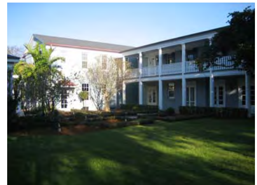
Historical Restoration Coral Gables Home